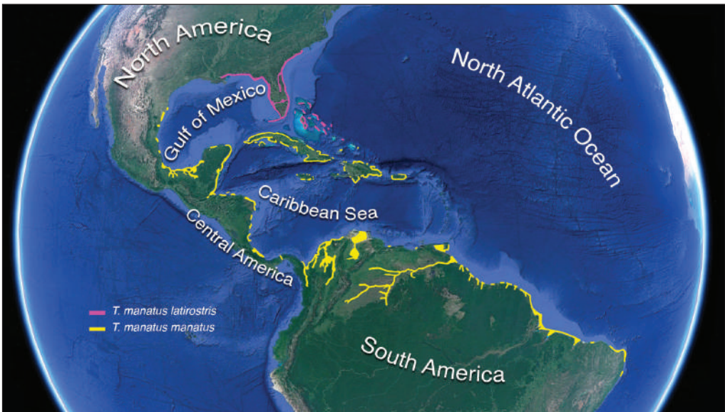
Figure 2. Current distribution of Trichechus manatus and its 2 currently recognized subspecies: T. m. latirostris (pink lines) and T. m. manatus (yellow lines).