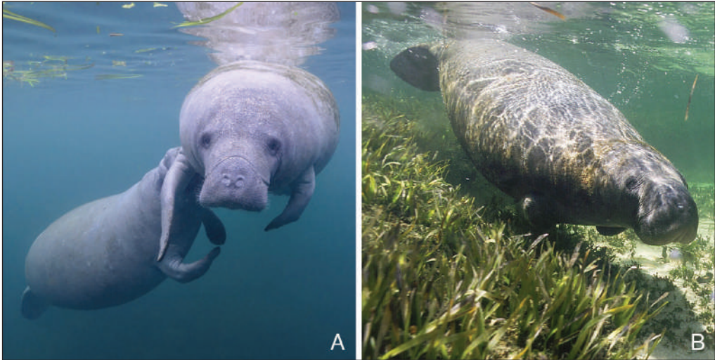
Figure 1. The 2 currently recognized subspecies of Trichechus manatus : (A) T. m. latirostris and (B) T. m. manatus.

Caribbean, and the northeastern part of South America (Fig. 2), is currently known in English as the “West Indian Manatee”, “Caribbean Manatee”, “Florida Manatee”, “American Manatee”, and “Sea Cow”; in Spanish as “Manatí de las Indias Occidentales”, “Manatí Antillano”, “Manatí Americano”, “Manatí de la Florida”, “Manatí Floridiano”, and “Vaca Marina”; in French as “Lamantin”, “Lamantin des Antilles”, and “Vache de Mer”; in Dutch as “Sekoe”, “Zeekoe”, “Caribische Lamantijn”, and “Amerikaanse Lamantijn”; and in Portuguese as “Peixe-boi” and “Peixe-boi Marinho”, among many other names (Table 1). Vernacular names during