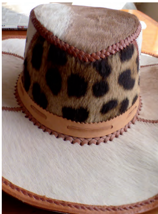
Fig. 3. Hat with jaguar skin.

While many news articles have suggested that a wide variety of jaguar body parts (including bones, meat, and organs) are being used in the context of Traditional Chinese Medicine (TCM) in China, official seizure evidence is mostly limited to teeth, and there is scant official evidence of the use of jaguar parts in TCM, making ‘Wenwan’ (subculture of collecting sophisticated items) a more likely driver of the trade (Li et al. 2022). In China, news reports suggest two pieces of alleged jaguar bones seized in 2014; 1,490 grams of jaguar bones and paws in 2014 (Anonymous 2014). The only official seizure made in China, referenced above, involved 119 jaguar teeth and 13 jaguar claws seized in 2015, the latter resulting in a custodial sentence of 4.5 years and a fine equivalent to USD 7,200 (He 2016). In 2019, nine ‘American lion’ teeth from Peru were seized, later identified as puma (Verheij 2019). It is unclear if suspects arrested at airports were in possession of jaguar parts for personal use, or intended to supply consolida-