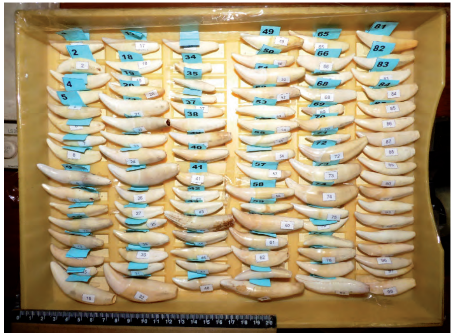
Fig. 1. Jaguar, puma, and ocelot canines seized from trafficking.

The location was assessed by researchers for 193 of all posts, with records from at least 17 countries (plus one subset indicating posts derived from one of two countries, but unclear which), however, only 64 posts from at least 9 countries included images that were definitely jaguar, the most prolific being Brazil, Mexico and Bolivia. For the 437 parts that were counted in posts, 15 categories of body parts were recorded, with teeth being the most popular item traded (156 posts totaling 367 teeth), followed by skins (Fig. 4), entire or fragments (37 skins, 1 skin piece and 1 skin scrap spanning at least seven countries), claws (12 posts of 14 claws), heads (nine posts counting nine heads) and additional posts related to parts including bones, bodies and live animals. Where the probable country of the post could be assessed (through platform addresses, stated business geo-tag and other contextual information, but not physically verified by researchers), jaguar skin posts were confined to jaguar range countries, with highest prevalence in Brazil, Peru, Bolivia, and Mexico. Meanwhile, posts advertising teeth were most prevalent in countries including Brazil, Mexico, Bolivia, China and Vietnam. However, following image verification, those proportions changed with Mexican posts representing over one quarter