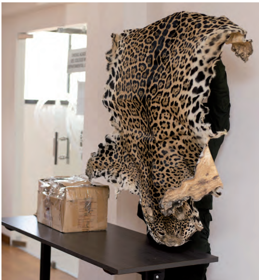
Fig. 4. Jaguar skin (hide).

For human-wildlife conflict where some flexibility to address chronic losses exists, few laws ensure such flexibility is not abused, since it potentially provides a window to legitimise killing for trade. To stop wildlife parts and by-products originating from legal self-defense or depredation control killings from entering the market – and therefore creating an incentive to cover up illegal hunting for trade – countries could adopt provisions similar to Peru: where the forest authority is in charge of disposing of the remains of legally-killed jaguars (with prior governmental authorisation). While enforcement is not yet ideal in Peru, such a legal mandate would simplify authorities' efforts to confiscate dead jaguars, thereby preventing parts from entering illegal trade.