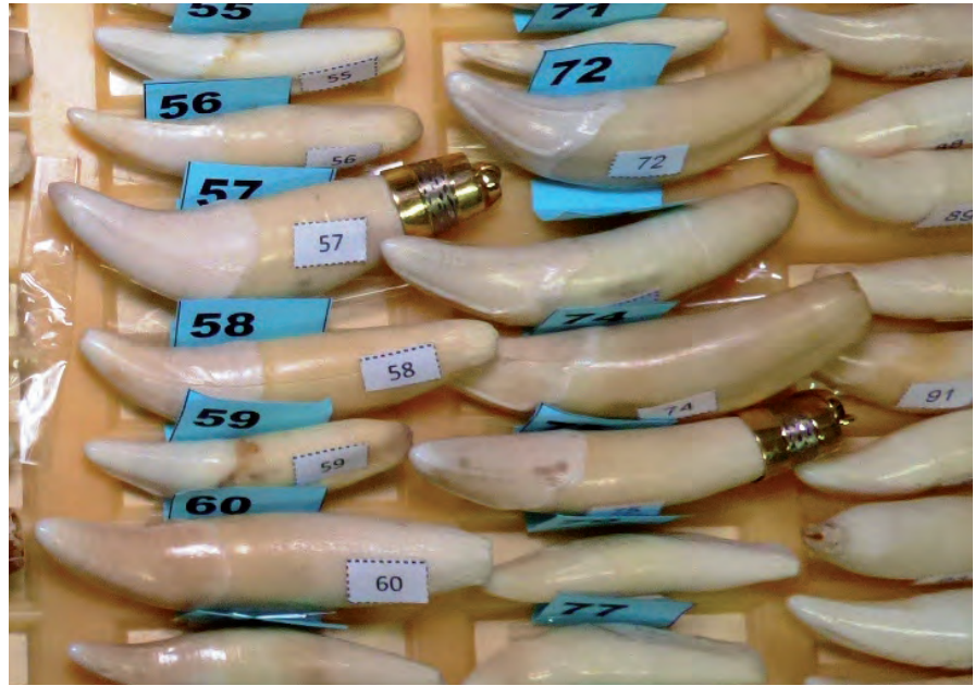
Fig. 2. Jaguar fangs (canines).

During online investigations, we recorded a total of 42 unique online advertisements of jaguar parts in Brazil in the last decade, involving 84 counted parts (72 teeth, 10 skins and two bodies; Polisar et al. 2023). Advertisements focused on handcrafts containing canines, such as sculptures and necklaces,