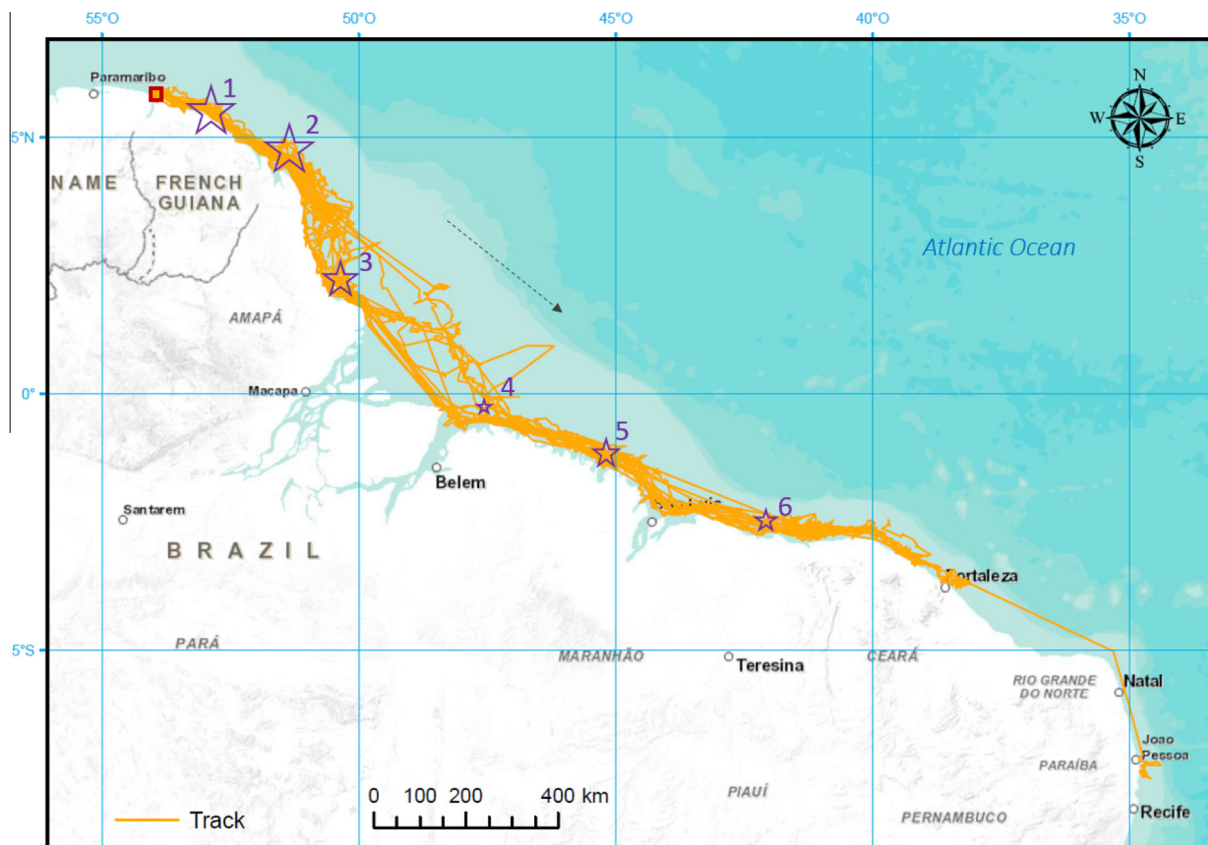
Fig. 2. Tracking of 16 green sea turtles along the north-eastern coast of South America. The red square indicates the starting location and the arrow shows the direction of their migration from the nesting sites in French Guiana and Suriname. The areas of particular interest (stopovers) are indicated by stars that are proportional to the number of turtles remaining in these areas, at least 5 days during their travel (in order: 7, 7, 5, 2, 4, and 3). (For interpretation of the references to color in this Fig. 2 legend, the reader is referred to the web version of this article.)