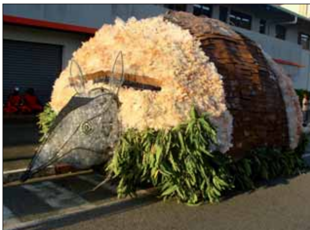
FIGURE 5. A representation of an armadillo at the main Carnival parade in Cayenne, February 2010.

were caught alone with no other conspecific in the immediate vicinity;