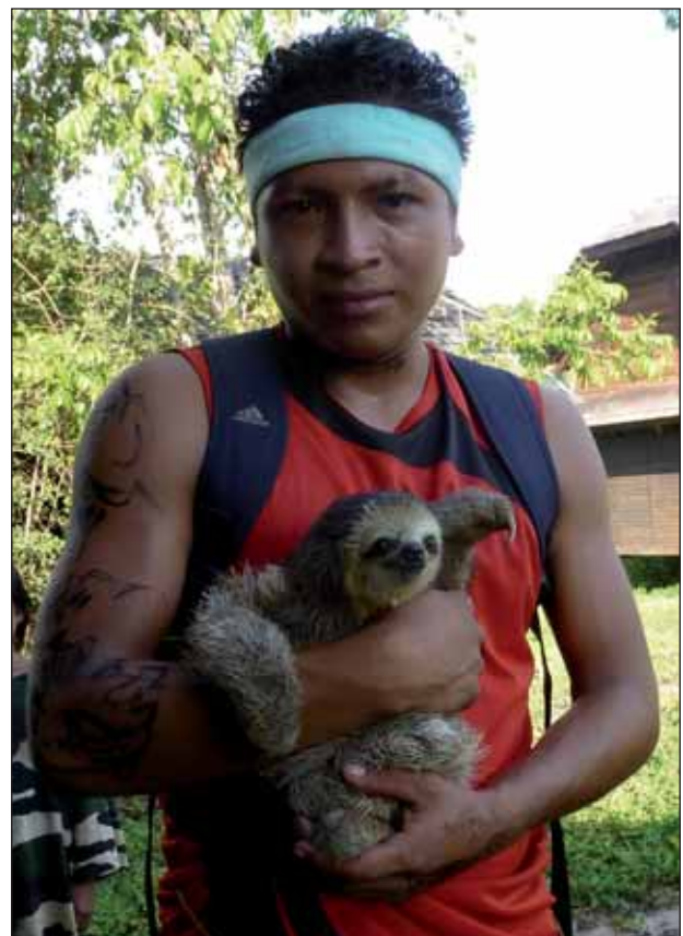
FIGURE 4. A young Bradypus tridactylus kept as a tamed pet by a Wayāpi Amerindian at Trois-Sauts. Photograph by François Catzefflis (November 2010).

Sloths, in their turn, benefit from a very positive value assigned to them in Wayāpi culture. If Bradypus tridactylus is the commonest game sloth in numbers, the two-toed sloths are even more appreciated. Both taxa are regularly kept as pets (FIG. 4),