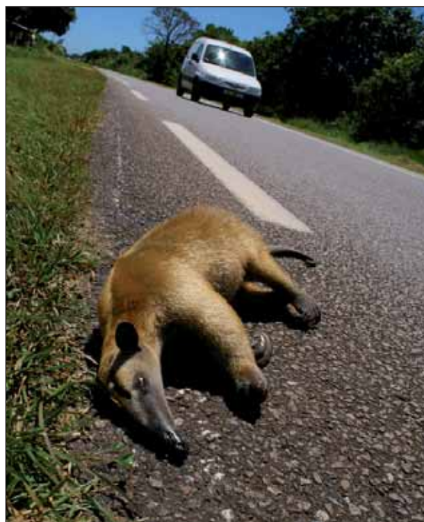
FIGURE 2. Roadkills are rather common along the paved roads in the northern part of French Guiana. Photograph by Sebastien Barrioz of a Tamandua tetradactyla along national road RN1 between Cayenne and Kourou.

According to reported observations in our database, all nine species of xenarthrans have been found as roadkills in French Guiana, but there has been no regular survey for quantifying road mortality. Certainly the most commonly found is Tamandua tetradactyla , which accounts for 14 out of